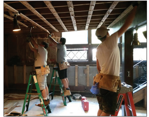
House Flipping 101

Overall, we want our students to be champions of their future. There are many options and possibilities in today’s current environment. As a school staff, we will continue to explore how we can improve our offerings and do our best to serve every student.