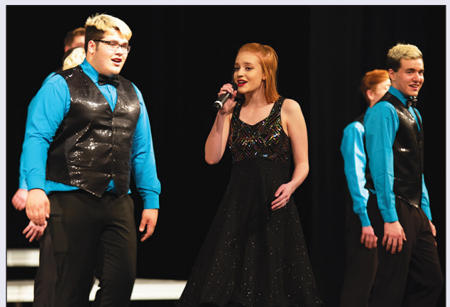
The Perry Buccaneers Show Choir

There's also still plenty of time to catch a home football, volleyball or soccer game. To find your favorite Pirate teams' schedule, go to perrypirates.org