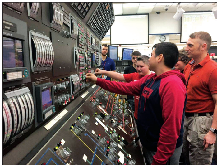
The 7th & 8th Grade Career Ties Mentoring Program

scores are certainly not our complete story, nor do they reflect the vision for the Perry student experience.